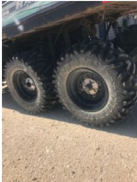
Outside Entry - 3