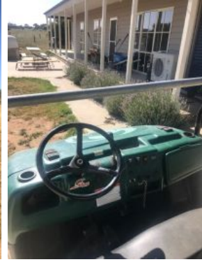
Outside Entry - 3