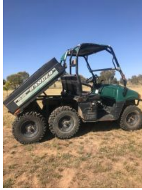
Outside Entry - 3