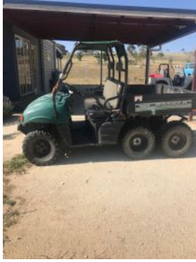
Outside Entry - 3