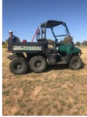
Outside Entry - 3